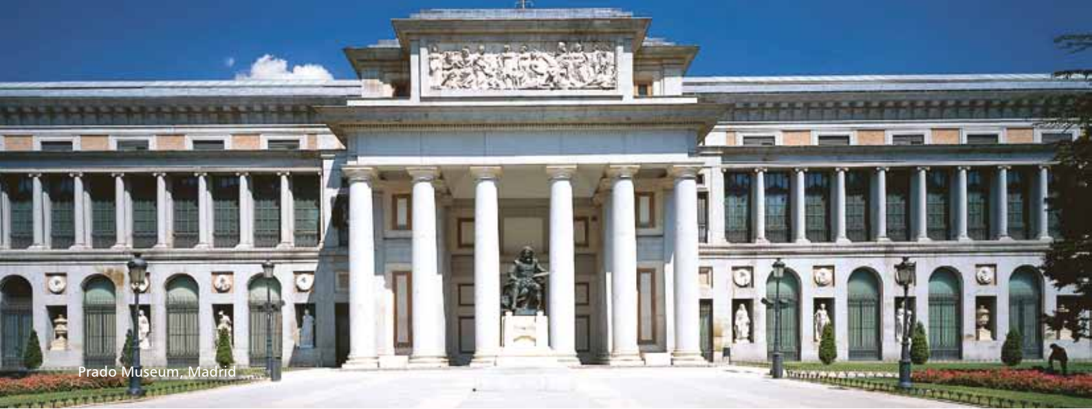
Prado Museum, Madrid