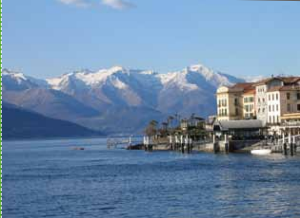
Lake Como, Italy