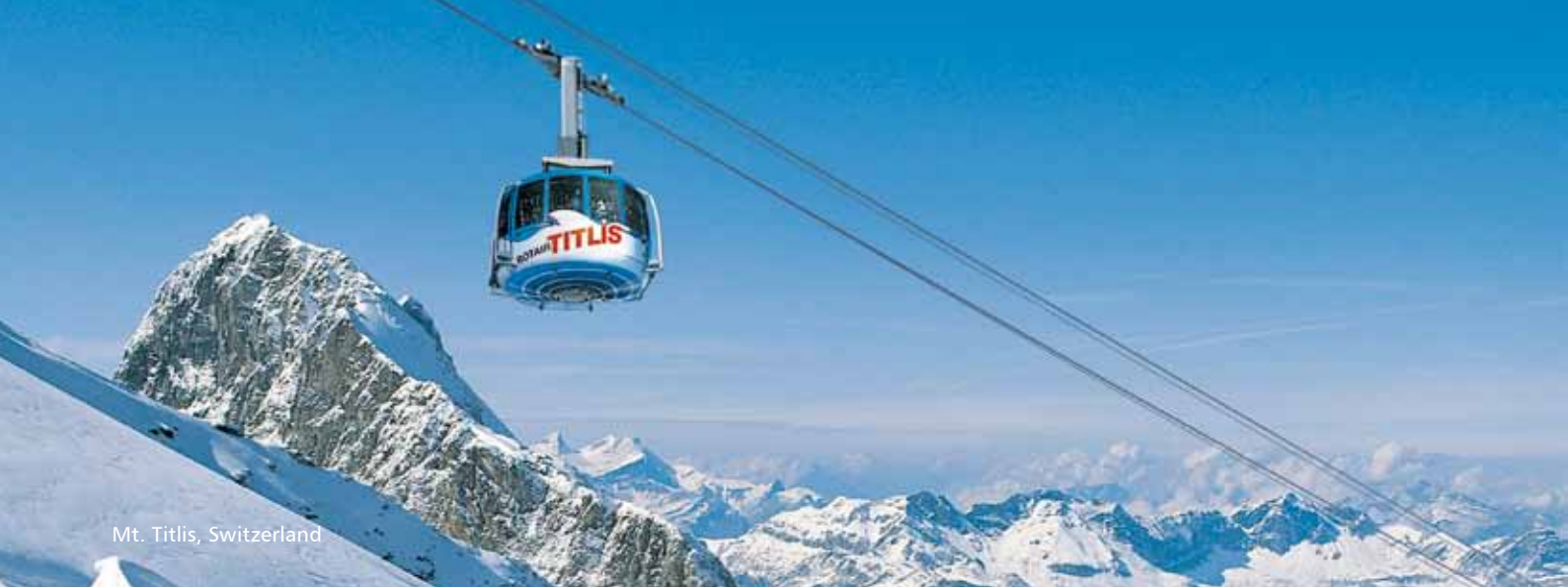
Mt. Titlis, Switzerland