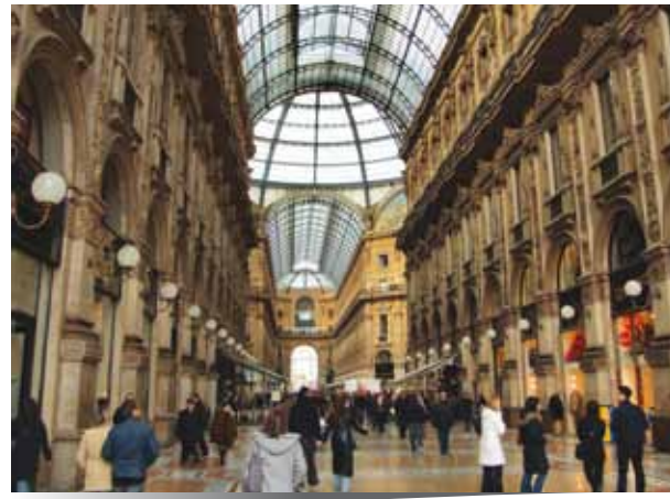
Victor Emmanuel II Gallery, Milan

Overnight at Hotel Seaside Park Residence or similar in Nice. ( during the Grand Prix your hotel may not be in Nice) (B, D)