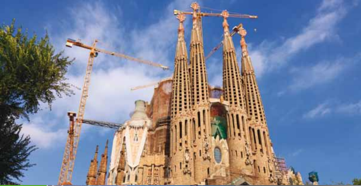
Sagrada Familia, Barcelona