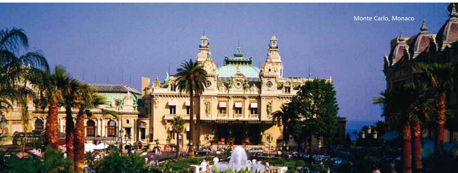
Monte Carlo, Monaco