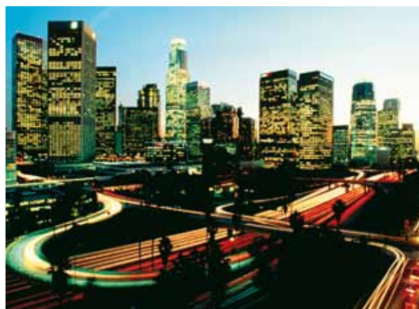
Los Angeles Skyline