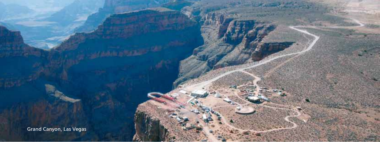
Grand Canyon, Las Vegas