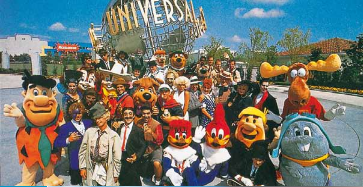
Universal Studios, Los Angeles