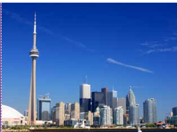
Visit: Montreal, Ottawa, Kingston and Toronto For detailed itinerary see page 68