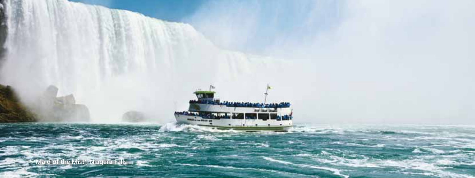
'Maid of the Mist', Niagara Falls