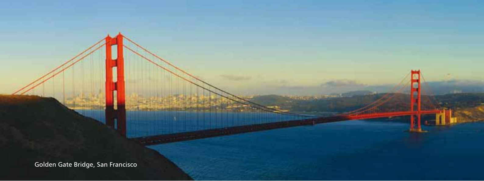
Golden Gate Bridge, San Francisco