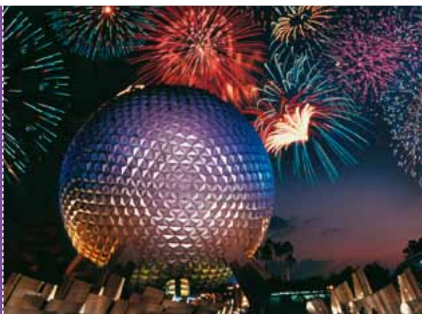
Visit: Magic Kingdom and Epcot