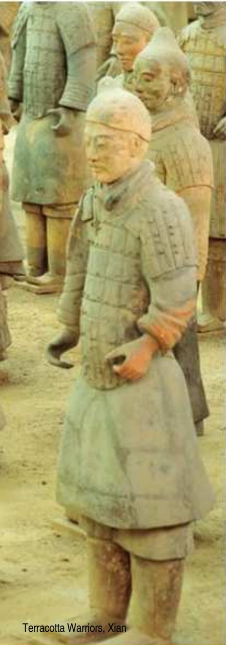
Terracotta Warriors, Xian

famous city with beautiful scenery and one of the best places to shop for Chinese souvenirs, gems, traditional bamboo and wood carvings. On arrival, visit Elephant Trunk Hill , one of the most famous sights of River Li. The hill looks like an elephant dipping its snout into the Li River, and that gives it the curious name. Also, peer over the confluence of Li River and Peach Blossom River at the site. Next, visit Fubo Hill to the northeast of downtown Guilin and it has the famous Xixi Marquis Temple built during the Tang dynasty. It is also one of Guilin's karst mountains, but with the most unique and interesting shape of all of them. (B, D)