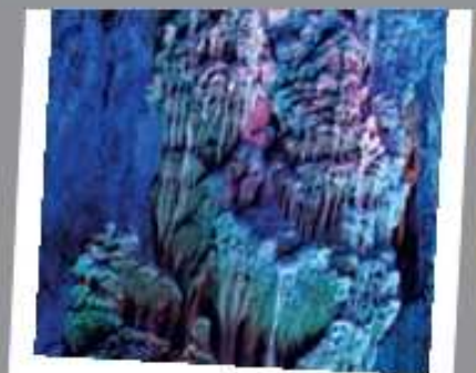
Reed Flute Cavern, Guilin