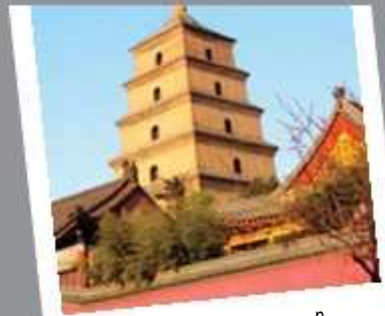
Wild Goose Pagoda, Xi'an