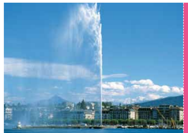
Jet D'Eau, Geneva