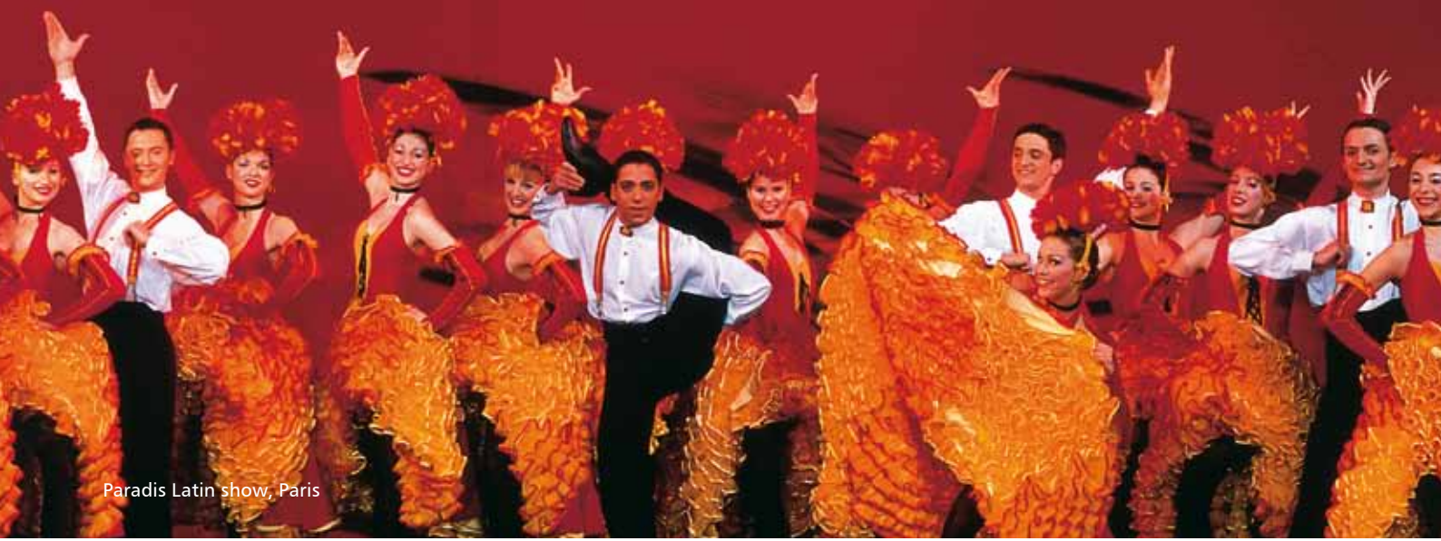
Paradis Latin show, Paris