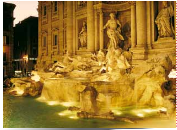
Trevi Fountain, Rome