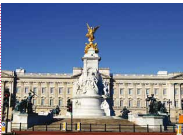
Buckingham Palace, London