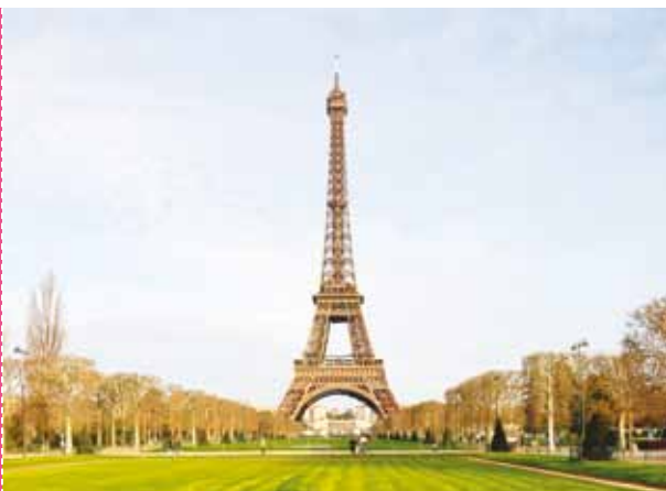
Eiffel Tower, Paris