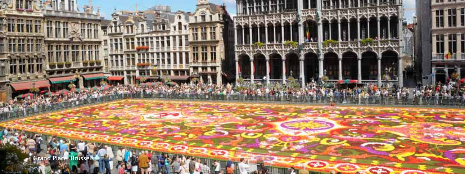
Grand Place, Brussels