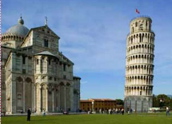
Field of Miracles, Pisa