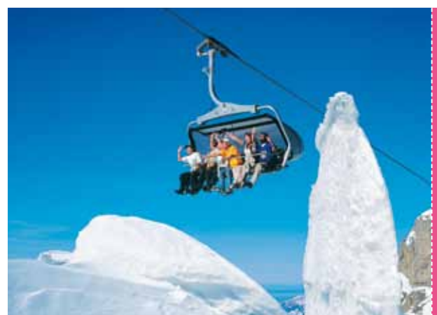
Mt. Titlis, Switzerland