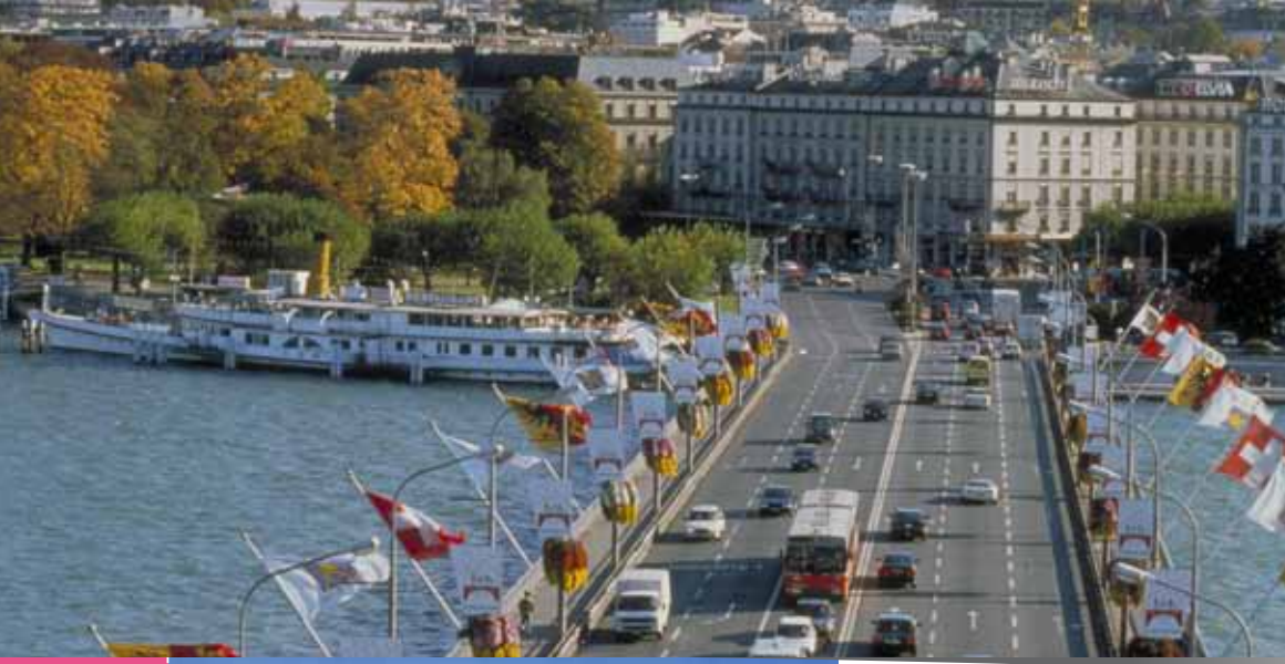
Mont Blanc Bridge, Geneva