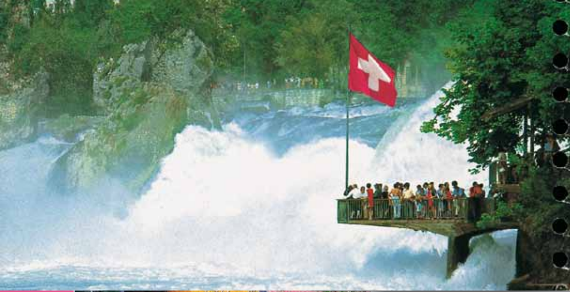
Rhine Falls, Switzerland