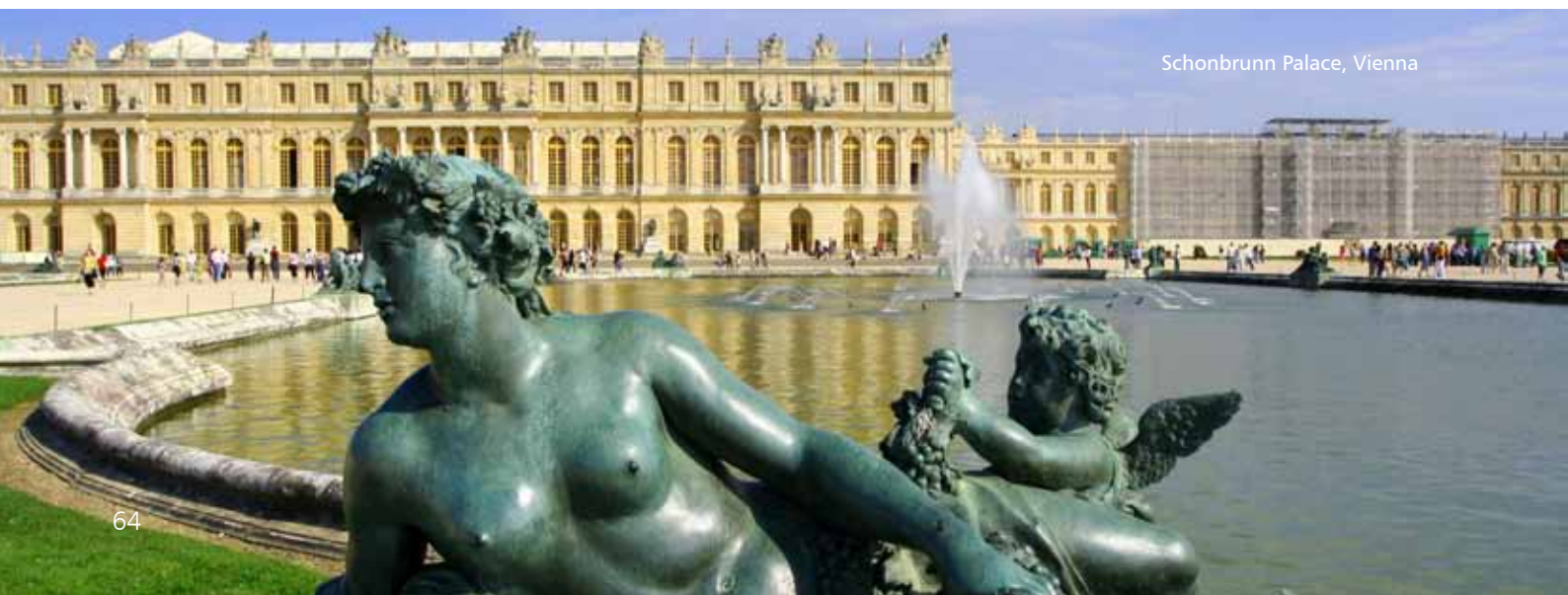
Schonbrunn Palace, Vienna