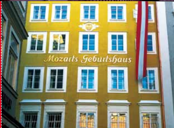
Mozart Geburtshaus, Salzburg