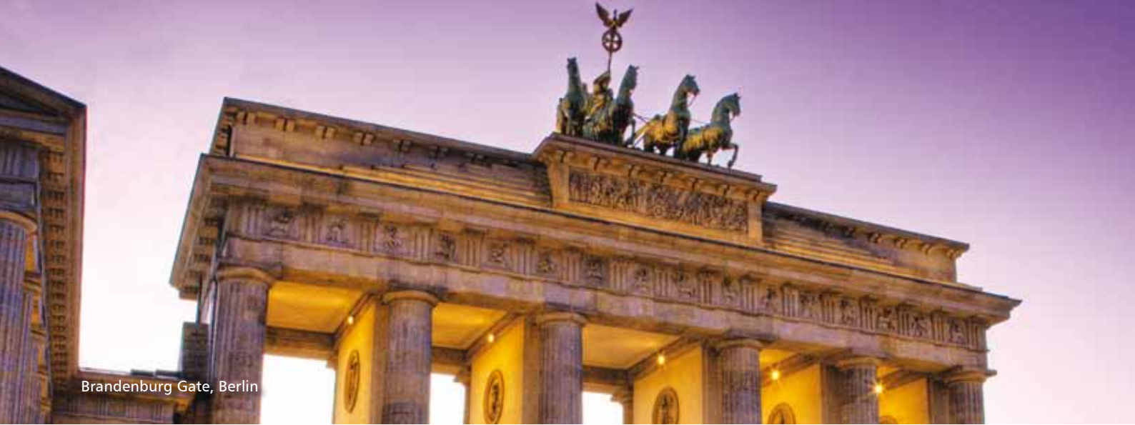
Brandenburg Gate, Berlin