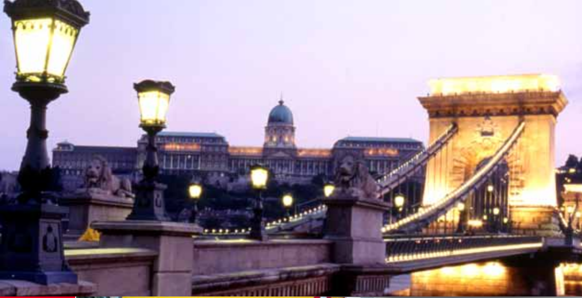
Charles Bridge, Prague