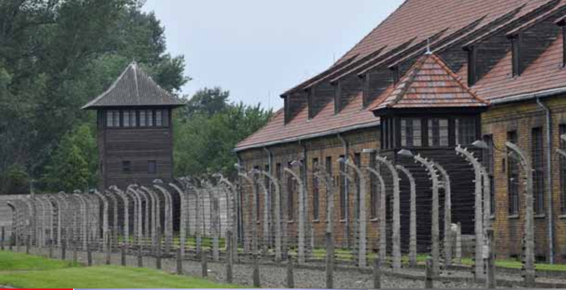
Auschwitz Concentration Camp