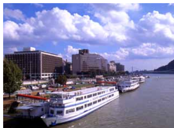
Danube River Cruise, Budapest