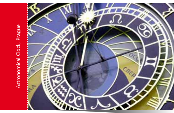
Astronomical Clock, Prague