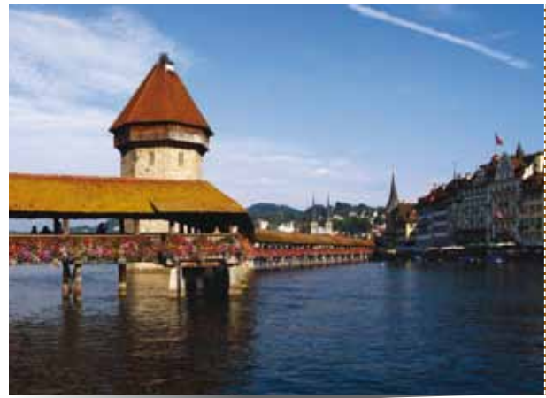
Kappel Brücke, Lucerne