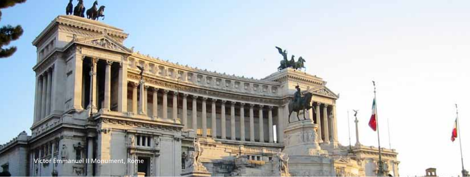
Victor Emmanuel II Monument, Rome