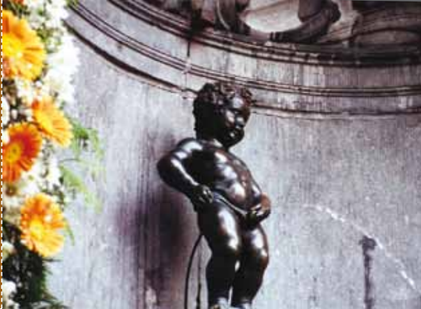
Maneken Pis, Brussels

Also see the Champs Elysees, arguably the most well known avenue in the world, the magnificent Opera, the striking Town Hall, the National Assembly and the famous Notre Dame Cathedral. See the dome of the Invalides and the famous Ritz Hotel at Vendome Square. Visit the famous Fragonard Perfume Museum. Seize opportunity to buy wide range of original and classic Fragonard Perfumes.