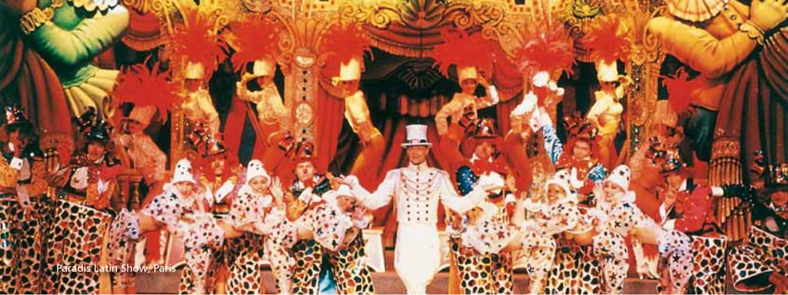
Paradis Latin Show, Paris