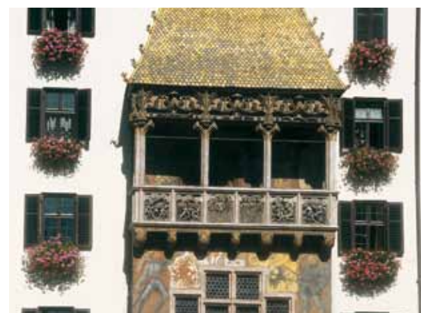
Golden Roof, Innsbruck