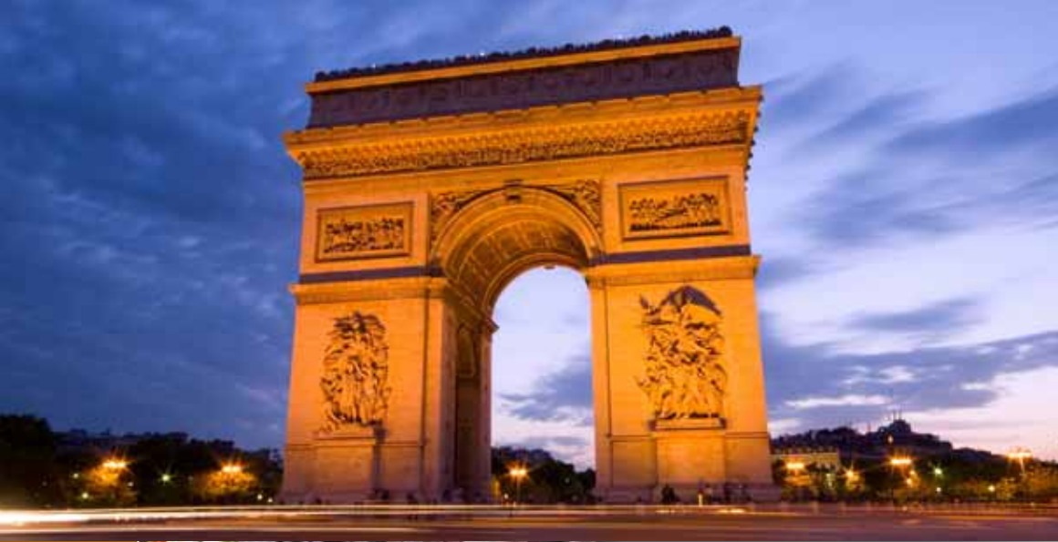
Arc de triomphe, Paris