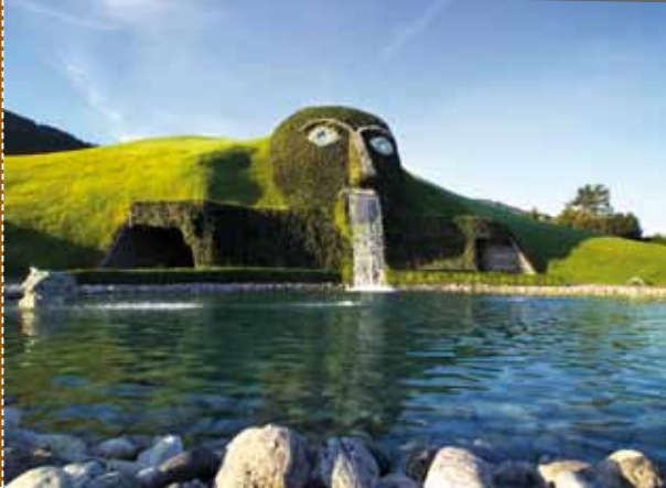
Swarovski Crystal World, Wattens